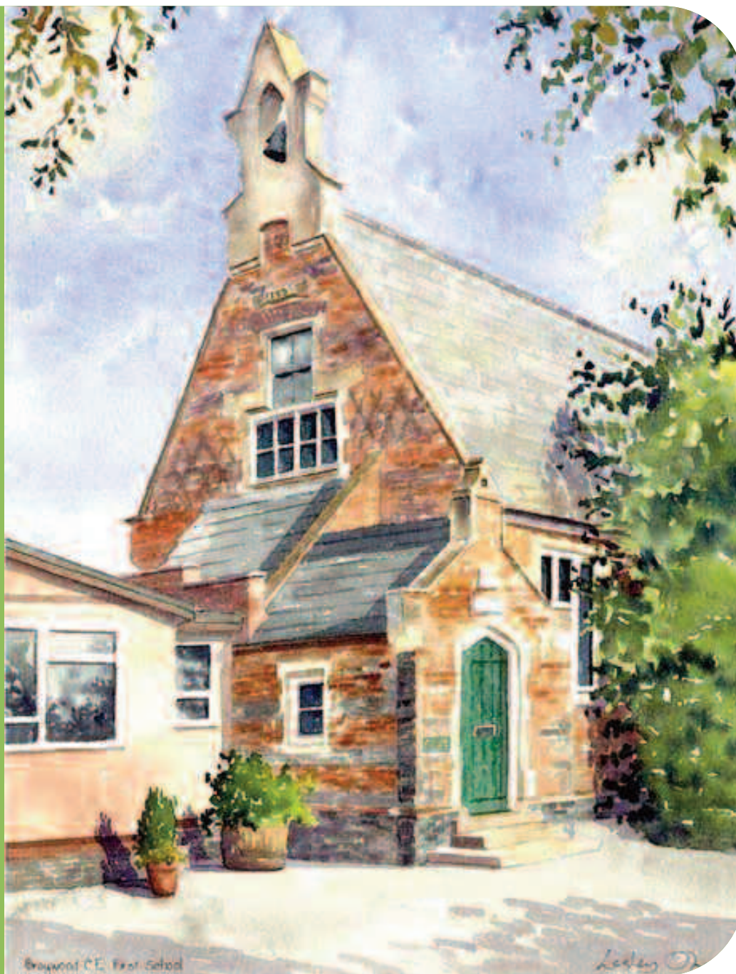
Braywood C of E First School

"From tiny acorns mighty oak trees grow"