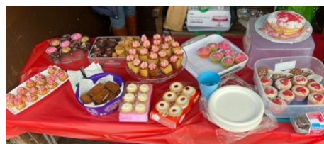
Valentine Cake Sale